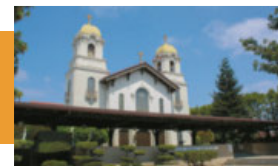
Table of Plenty

Table of Plenty would like to express heartfelt thanks to all who support our ministry, and thus our food-insecure guests every Saturday morning.