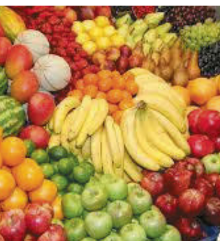
Table of Plenty

Enjoy $5 and $10 Grab & Go meal options. Proceeds benefit parish projects. Thank you for your support.